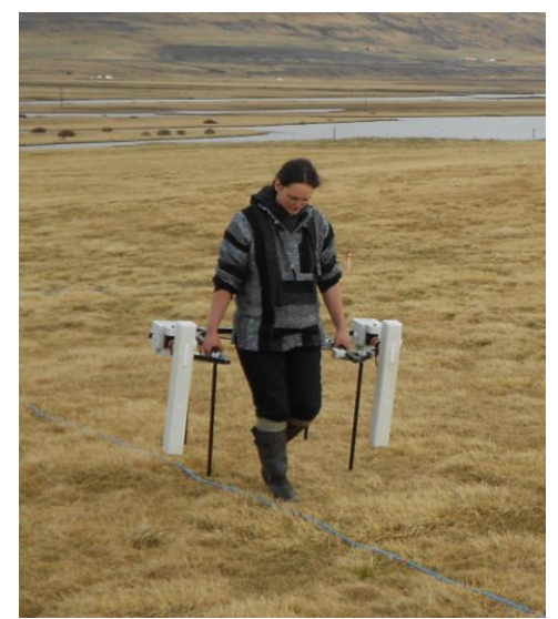
Magnetometer Survey (FM256)

The collection of resistivity data in the field is a slower process than magnetometry. Therefore, where both techniques have been used, the area covered by the magnetometer survey is larger than the area covered through resistivity. This is because the magnetometers automatically log readings every 0.25m as they are being carried in the traverse direction, whereas resistivity survey requires the operator to stop and insert the probes in the ground at set increments (0.5m in this case).